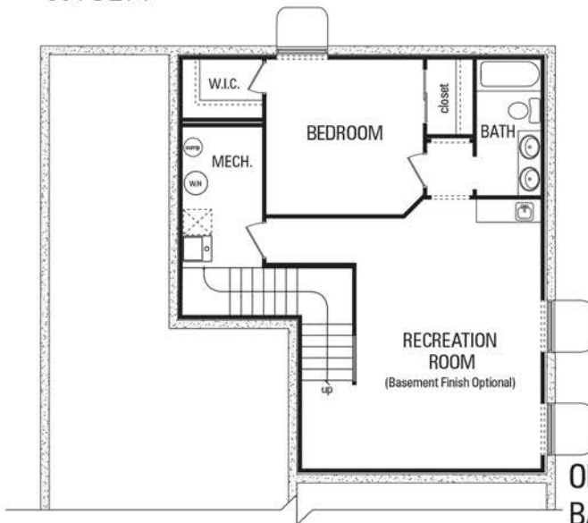
OPT. FINISHED BASEMENT 814 SQ. FT