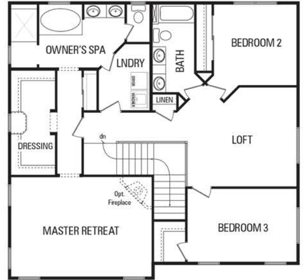
UPPER LEVEL 1480 SQ. FT