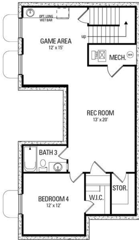
OPT. FINISHED BASEMENT 892 SQ. FT