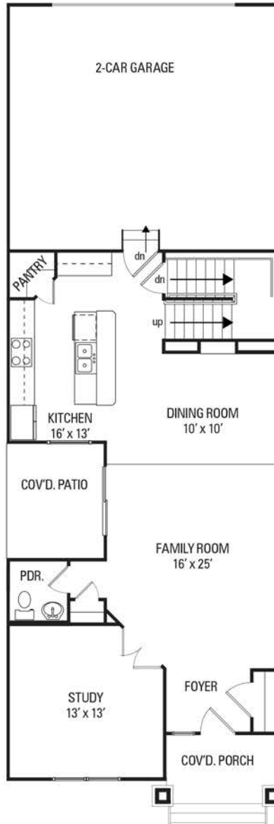
MAIN LEVEL 990 SQ. FT